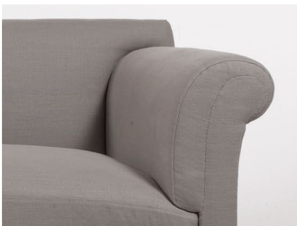
Plain Seamed facing