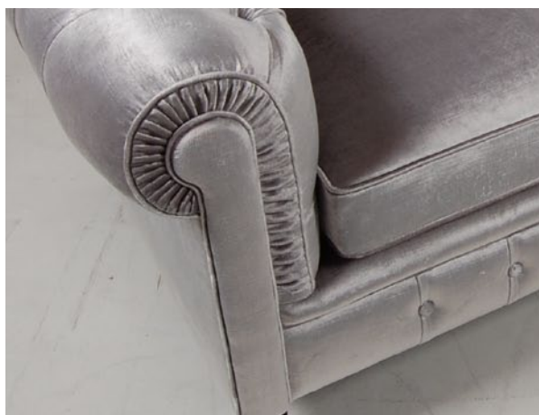
Roused & capped facing