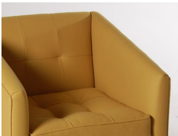
Inverted pin tuck