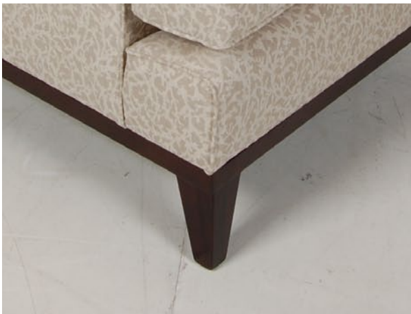
Square taper leg